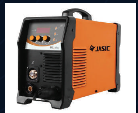
MIG - 200 N2A7