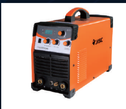
TIG - 300 W229