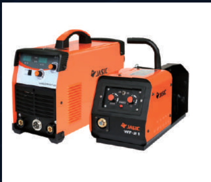
MIG - 250F N253