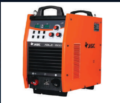
AGILE - 500