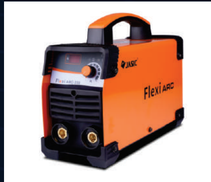
Flexi ARC - 250