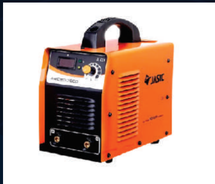
ARC - 200ECO