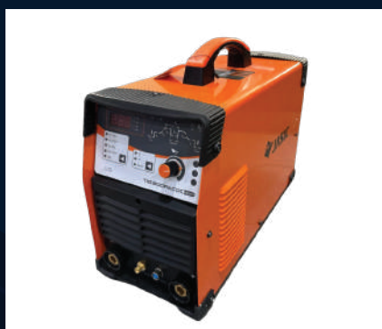
TIG - 300P AC/DC E 20101