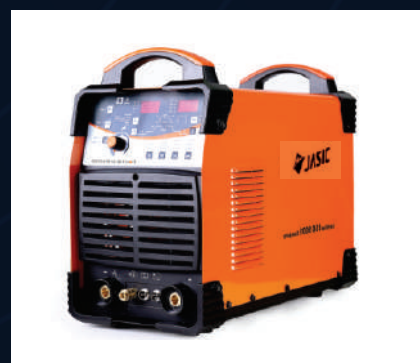
Flexi TIG - 315P ACDC