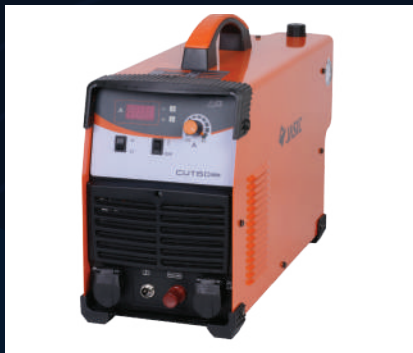
CUT- 60 L224/80 L225