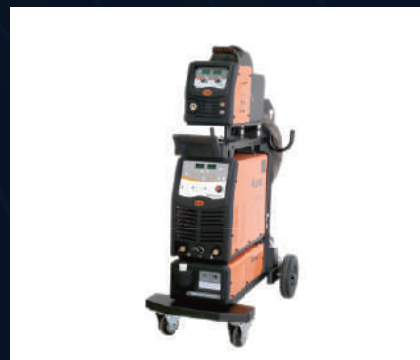
MIG - 400 N317 (PULSE)