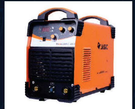
Flexi ARC - 400 Z298