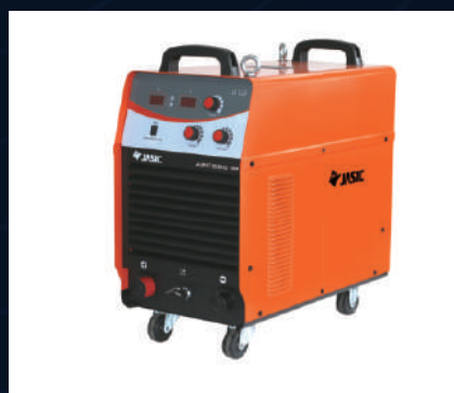
ARC - 630 Z321