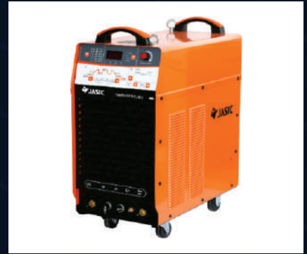
TIG - 500 AC/DC E312 (DIGITAL)