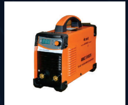
CLASSIC - 300