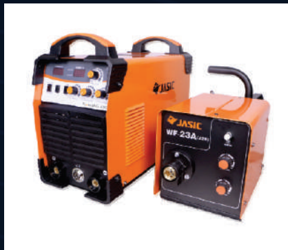
Flexi MIG - 400