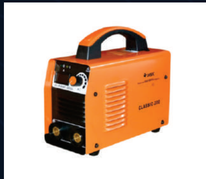
CLASSIC - 200