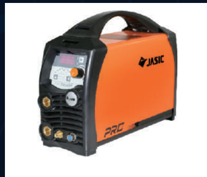
TIG - 200P W212 (DIGITAL)