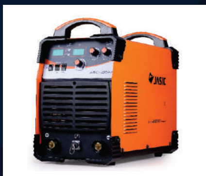
ARC - 400IM Z312