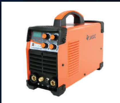
TIG - 200P W224