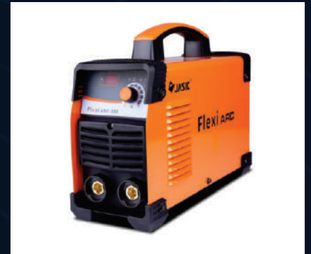
Flexi ARC - 300