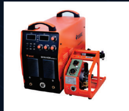
MIG - 400 N361