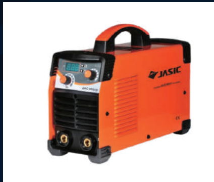
ARC - 300XP Z276