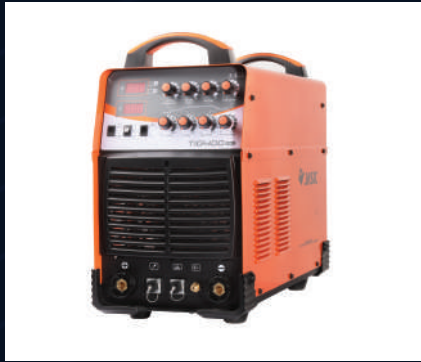
TIG - 400/400P W39801/W322