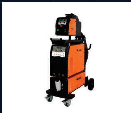
MIG - 500 N 398 (SYNERGIC)