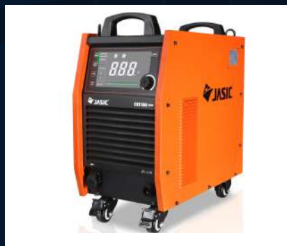
CUT - 160 316 II