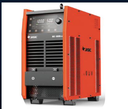
MZ - 1000/1250 M308/M3101