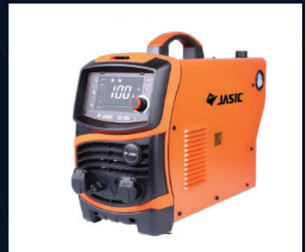
CUT- 100 L221 II