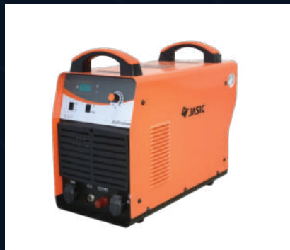
CUT - 100 L221