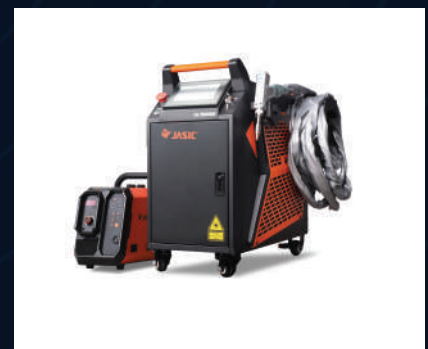
Laser welding Machine