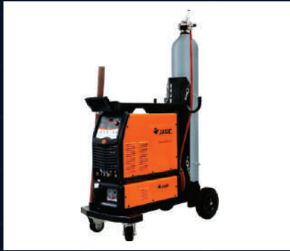
TIG - 400P W32203 (DIGITAL)