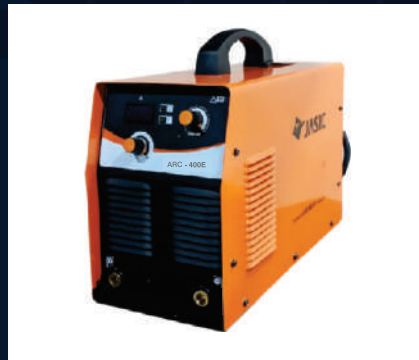
ARC - 400E Z227