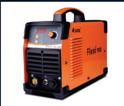
Flexi TIG - 200