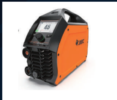
CUT -45 PFC SC LCD L2S43