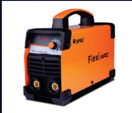
Flexi ARC - 200